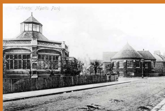
Longfield Hall & Minet Library 1890